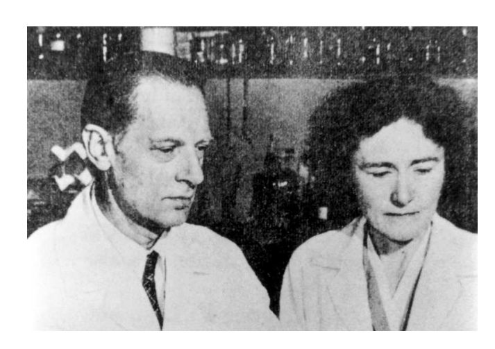
Carl and Gerty Cori, the 1947 Nobel Laureates.

In view of these developments, it seems timely to reflect on the early days of research on protein phosphorylation. How was this phenomenon originally discovered as a control mechanism and why did it take